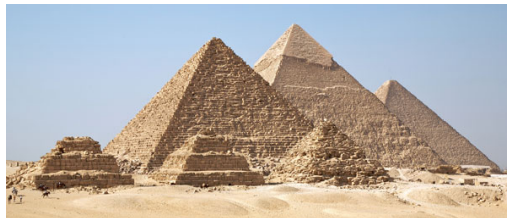
The Gizah Pyramids