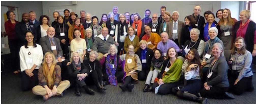
2016 New York Workshop Participants

This workshop is specifically designed to stimulate collaboration, conversation, and mutually energizing connections. Moving beyond the conventional lecture/presentation format, we aim to meet in a spirit of shared humility and equal dignity.