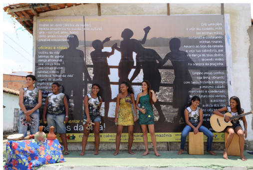
Cabelo Seco, Marabá, Pará