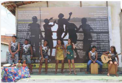
Cabelo Seco, Marabá, Pará