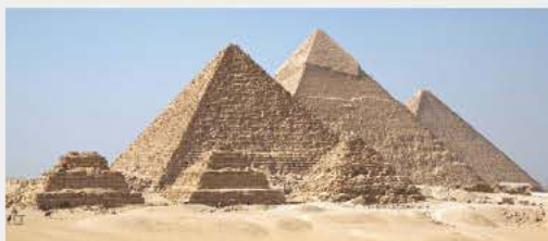
The Gizah Pyramids

We are also very thankful that our global dignity work was nominated again this year, as in 2015 and 2016. We were nominated by a group of people who, out of appreciation for the prize, wishes to refresh awareness of its roots. We are celebrating all the remarkable individuals and groups nominated for their extraordinary efforts (2015, 2016, 2017), in particular, those whose work resonates with the will of Alfred Nobel and his inspirer Bertha von Suttner (see also her 1889 book, Die Waffen nieder! or Lay Down Your Arms! ).