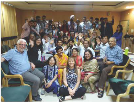
Annual Dignity Conference - Day 2