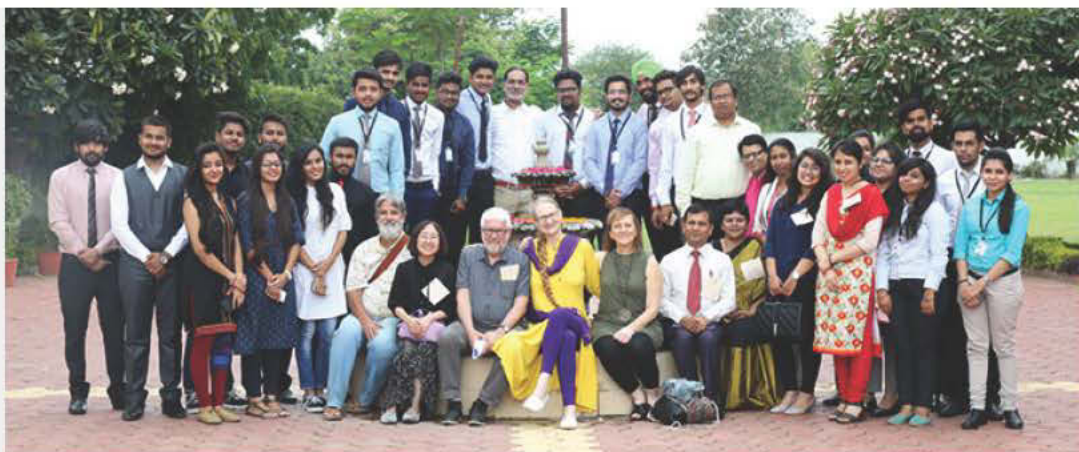
Annual Dignity Conference - Day 1

Indore, Madhya Pradesh, Central India Renaissance University August 16th - 19th, 2017