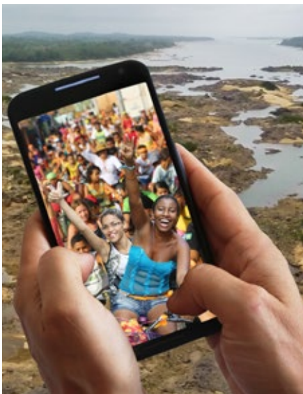
Cultural action to protect the River Tocantins, filmed and posted!

Marabá's population of 240,000 is governed by extreme social inequality and absence of human rights and justice, sustained by a drug-regulated civil war and the worst state high-school education in the country. We live above the largest deposit of iron-ore in the world. The current multinational exploitation will strengthen the corrupt, unelected elite that has just taken power in Brazil.