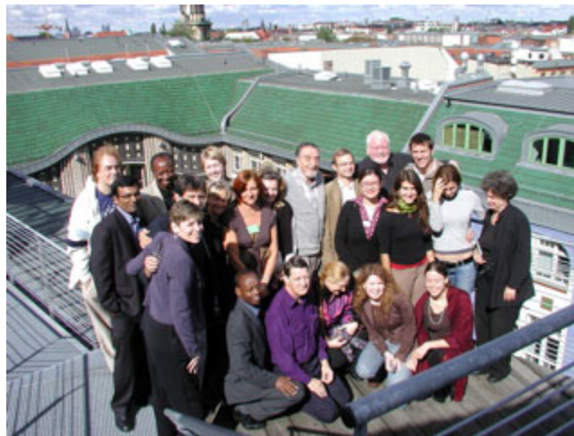
The group on the roofs of Berlin, Sept. 05